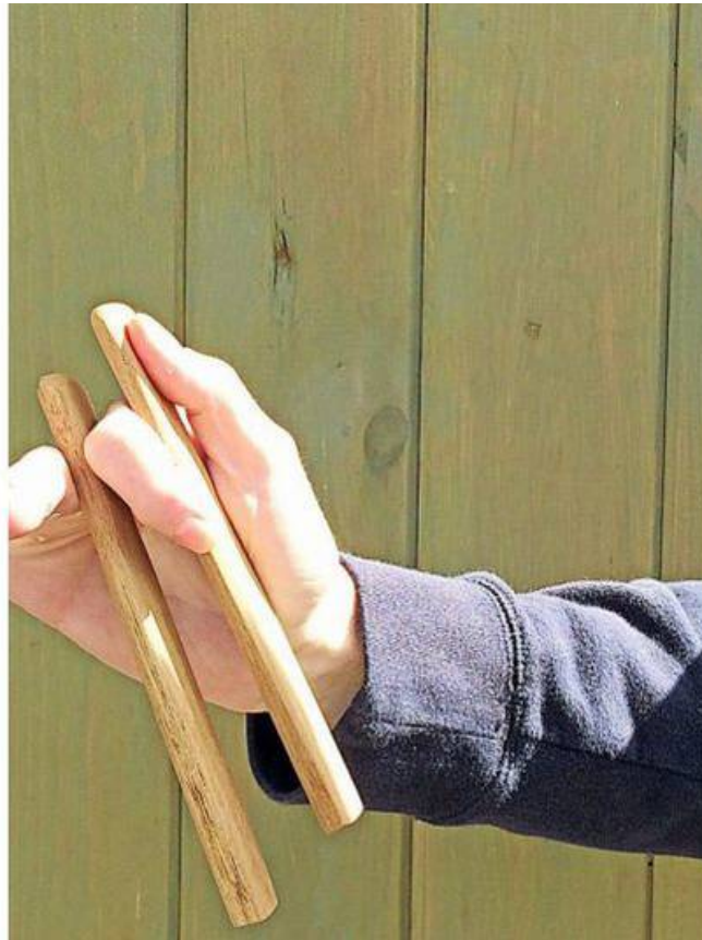
<p>A set of bones made from teak from the S.S. Baccalieu.</p>